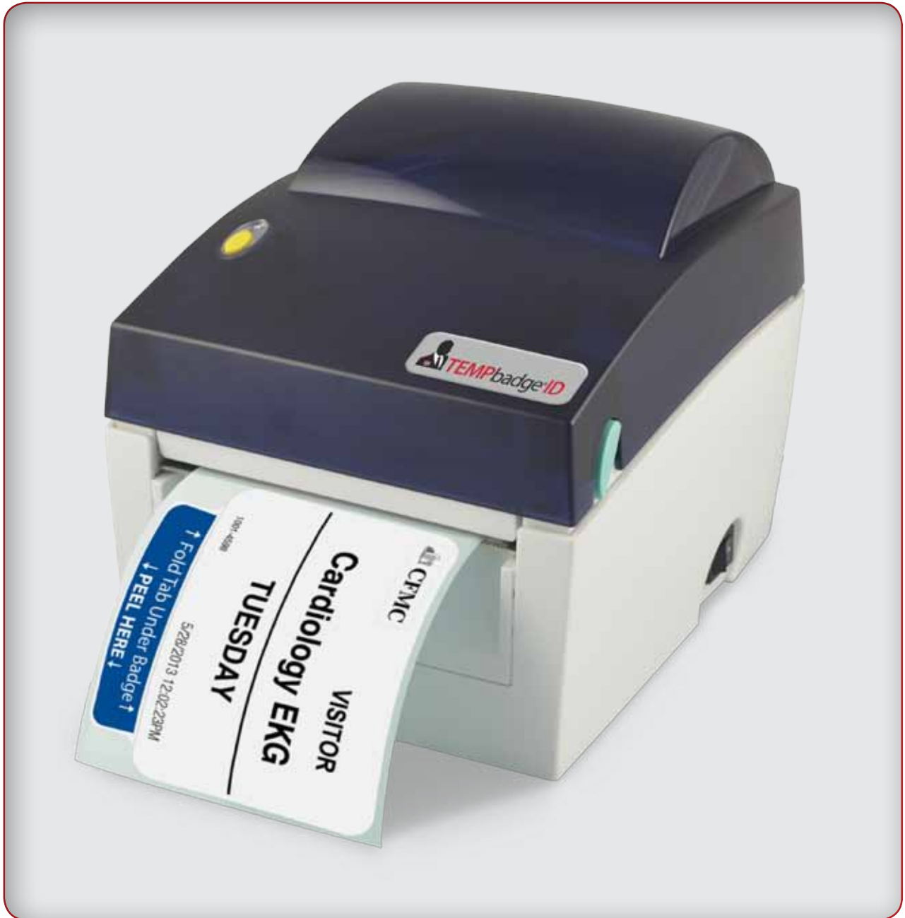
TEMPbadge® BP4 Direct Thermal Printer – Quick Start Guide –